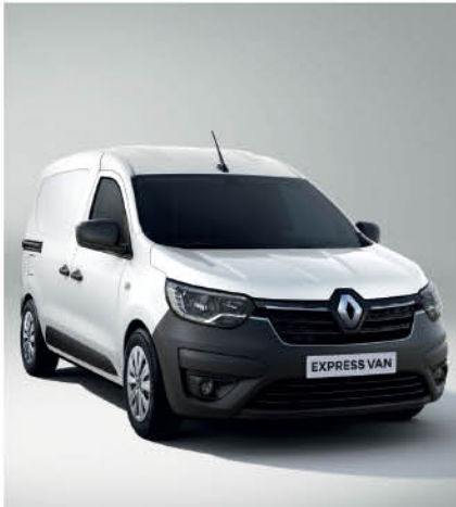
glacier white body color