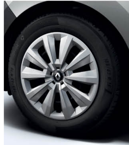
15" kijaro wheel trim