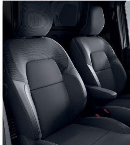
black fabric interior upholstery